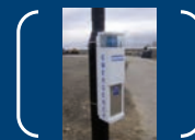
Emergency Call Boxes